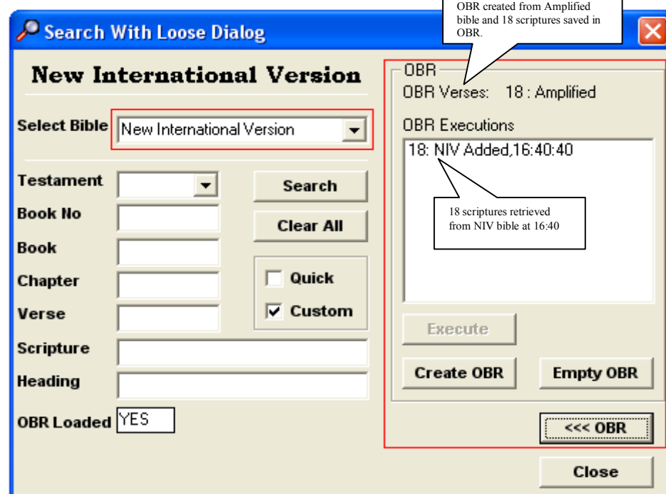
Figure 2 – Search Window