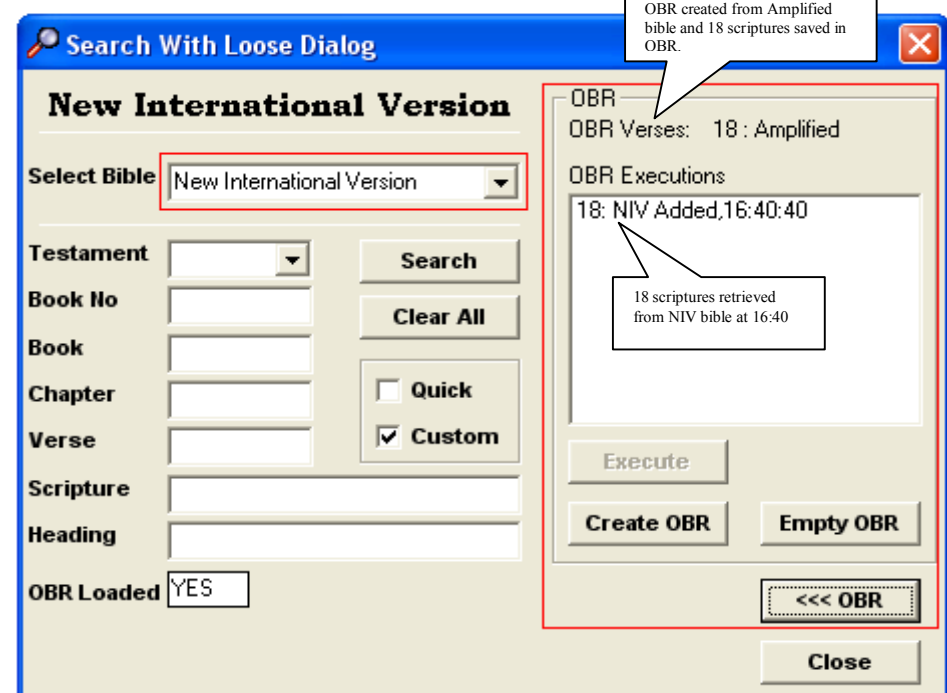
Figure 2 – Search Window